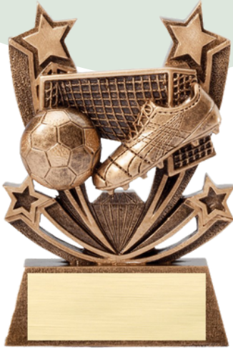
Soccer Approx. 5 in.

Available for each sport. Engraved player's name and team name*.