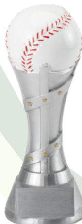
Baseball Approx. 7 in.