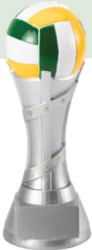
Volleyball Approx. 7 in.