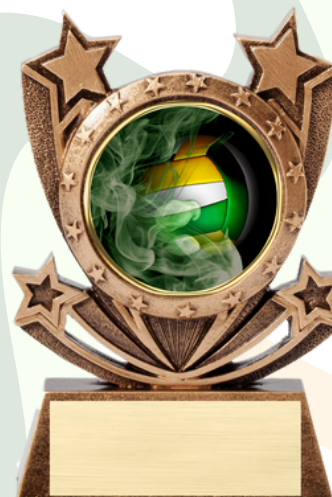
Volleyball Approx. 5 in.

*Products shown may be subject to change.