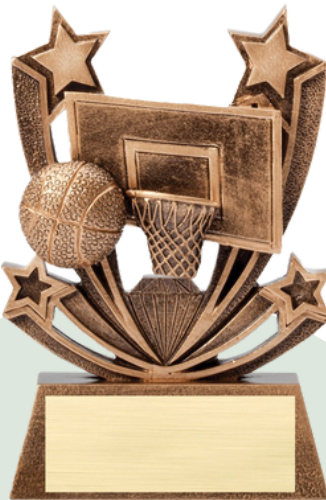
Basketball Approx. 5 in.