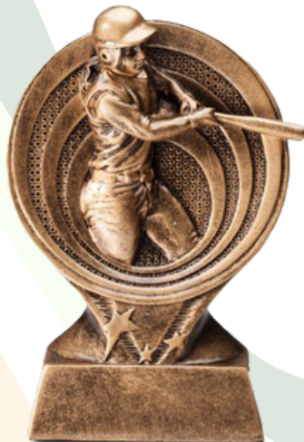
Softball Approx. 5 in.