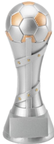
Soccer Approx. 7 in.