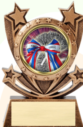
Cheer Approx. 5 in.