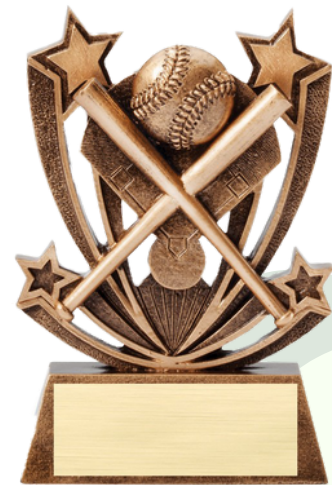
Baseball Approx. 5 in.