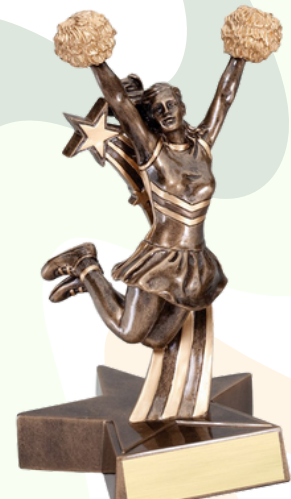
Cheer Approx. 7 in.