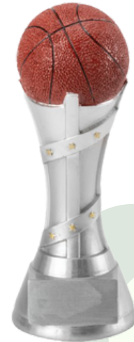
Basketball Approx. 7 in.