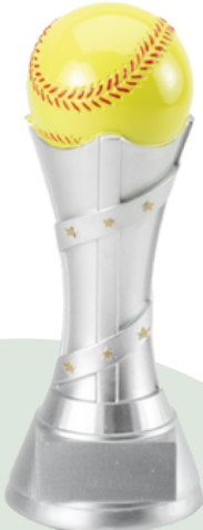
Softball Approx. 7 in.