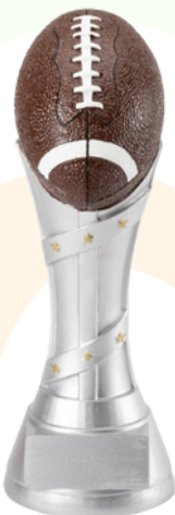
Football Approx. 7 in.