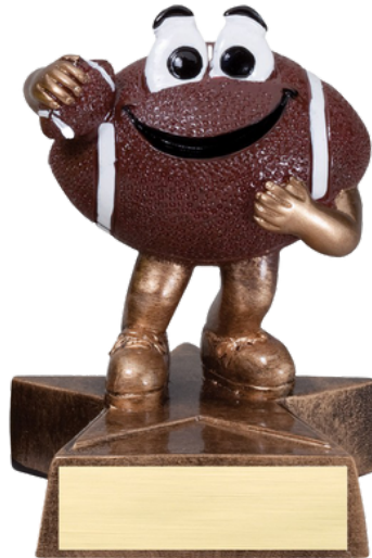
Football Approx. 5 in.