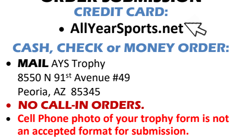
PHOTO / TROPHY PICKUP Choose ONE team representative to pick up photos and trophies for the whole team. Week before last game Visit allyearsports.net for more info.